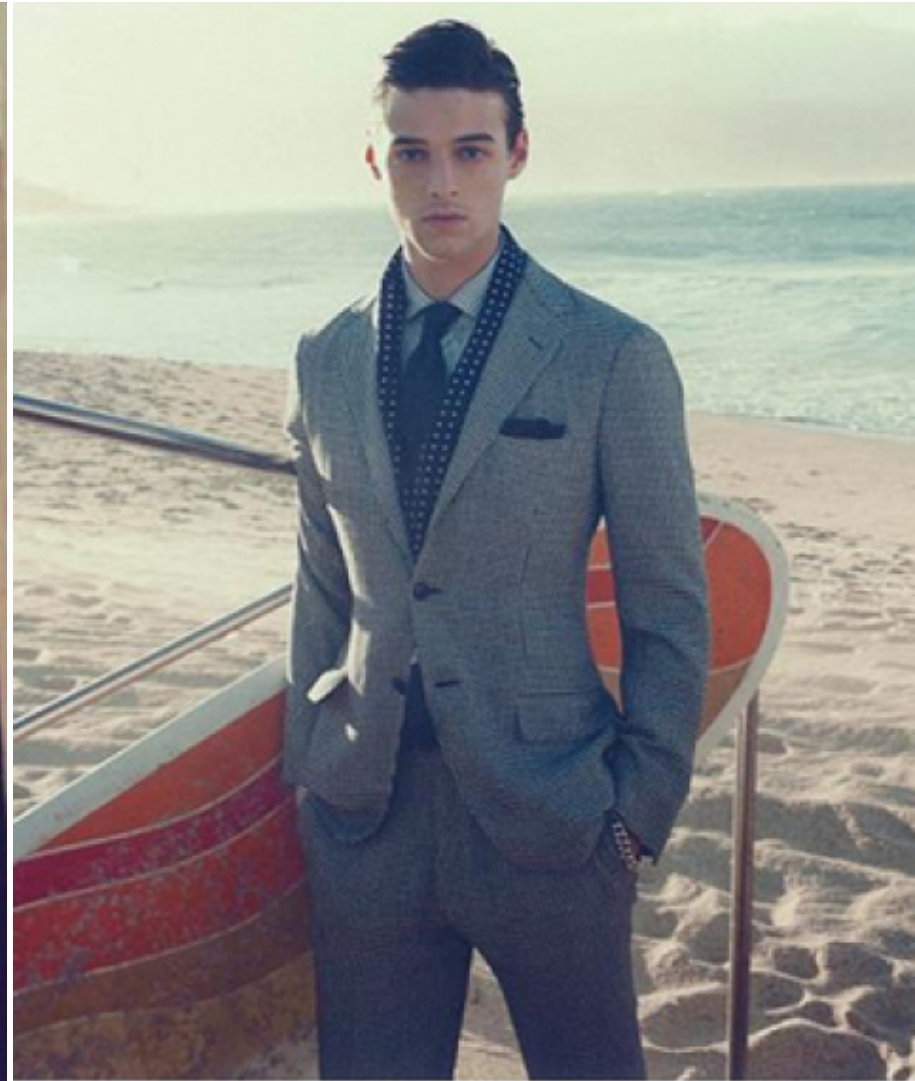
MP DI MASSIMO PIOMBO Three-button notch-lapel sport jacket and flat-front trousers in black/white houndstooth linen crêpe. Sizes 46-54. Italy. Jacket $2,495. Trousers $625. Shirt in blue/white stripe silk with spread collar. Sizes 38-43. Italy. $695. Tie in blue/black crosshatch-jacquard silk. Italy. $295. Pocket square in purple/black bandana-print silk. Italy. $95. Scarf in navy/white dot-pattern silk. Italy. $295. Third Floor. Bracelet, see page 232.

Height: 185 cm [6' 07"] | B/W/H: -- -- -- [0" 0" 0"] | Size: -- | Shoes: 43 | Hair: brown | Eyes: blue