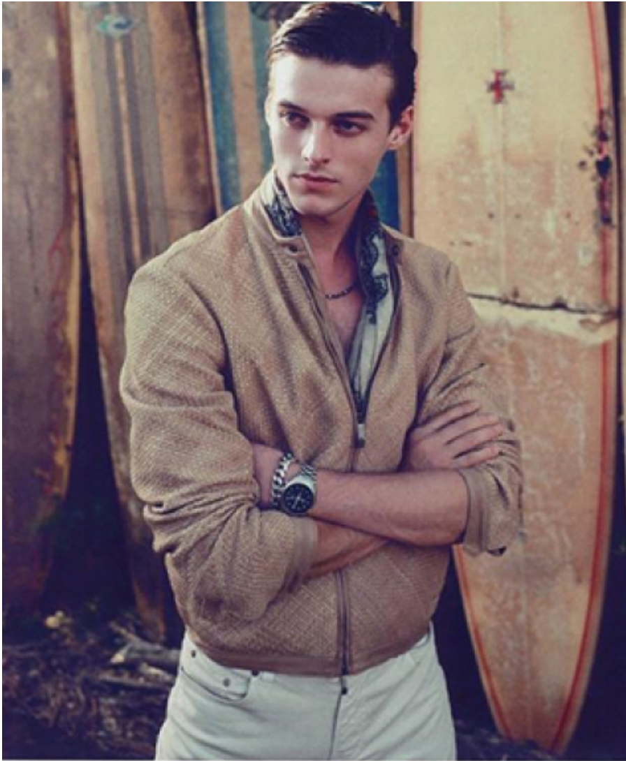
ETRO Racer jacket in beige woven lambskin. Sizes S-XXXL. Italy. $3,995. Scarf in beige/rust paisley-pattern cashmere/silk. Italy. $675. Five-pocket jeans in wheat cotton/elastane. Sizes 30-38. Italy. $520. Third Floor. Jeans also at BG.com . Watch and bracelet, see page 232.